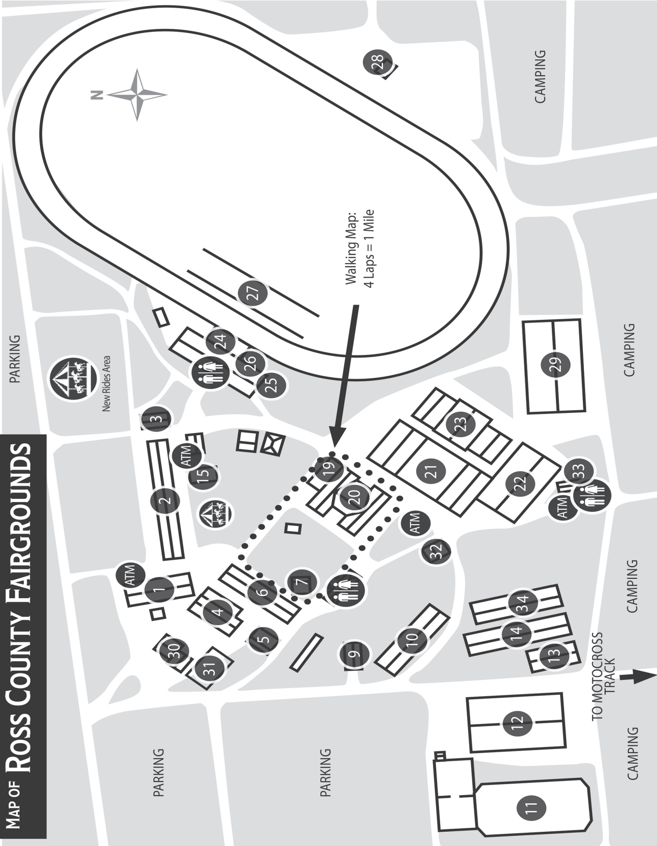
MAP OF ROSS COUNTY FAIRGROUNDS

Have a great time at the 2025 Ross County Fair!